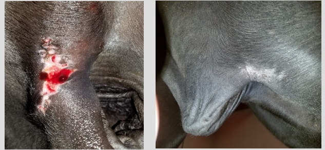
“Flirtini” – 11yo Hanoverian with nodular spindle cell carcinomas in sheath region (previously resected) -Immunocidin Equine infused four times