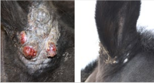
“Aida” – 17yo Thoroughbred with multiple sarcoids at base of ear. -Immunocidin Equine infused four times