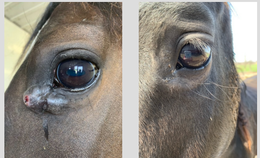
“Casey” – 5yo Dutch Harness horse with tumor at medial canthus -Immunocidin Equine infused three times